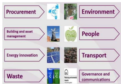
The front sheet of the sustainability criteria SWM uses to assess Heritage Fund grant applications.