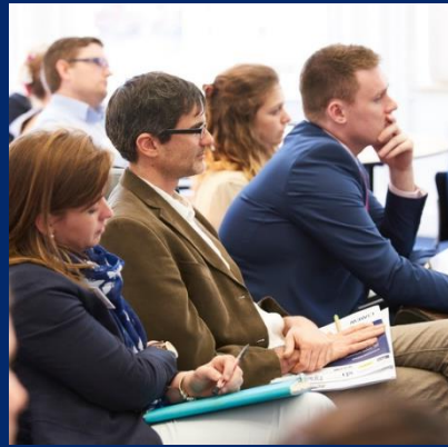
Training and Development