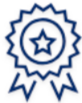
Qualifications and Standards

Our membership grades and qualifications add value and recognition to your achievements. We will actively help you to progress throughout your career and beyond.