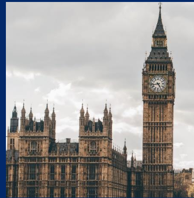
Policy and Advocacy