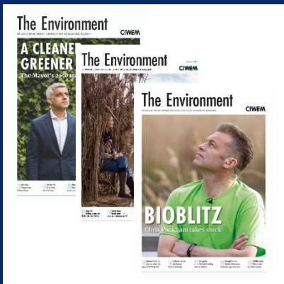
The Environment Magazine