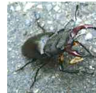
↑ Trafford Ecology Park, Manchester ← Stag beetle