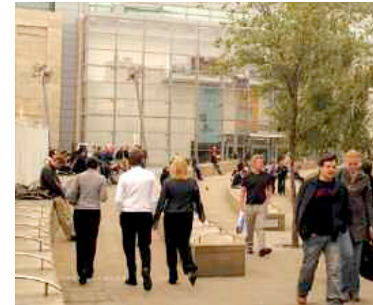
↑ Exchange Square, Manchester