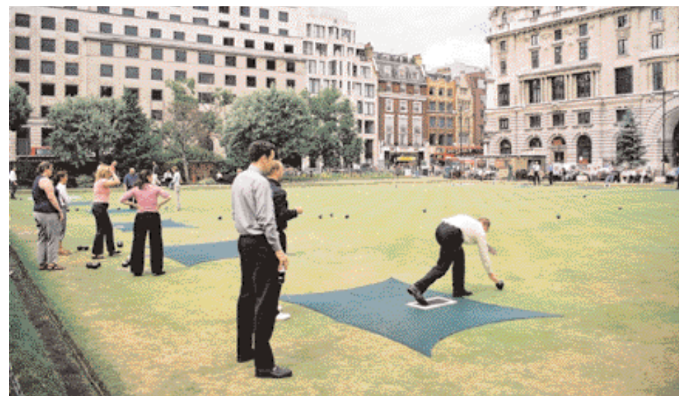
Finsbury Square, London