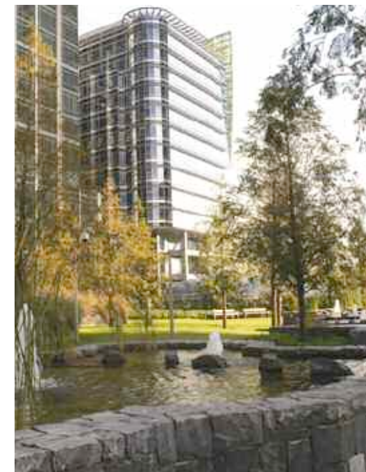
↑ Jubilee Park, Canary Wharf, London ← Thames Barrier Park, London