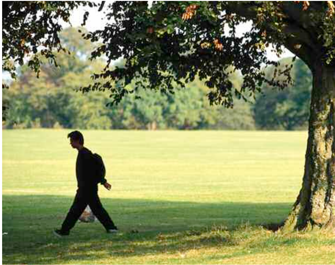
Clifton Downs, Bristol