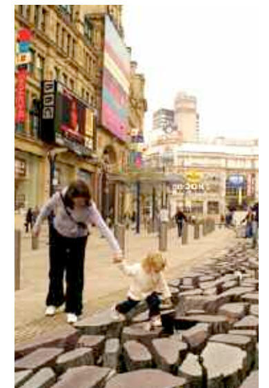
Exchange Square, Manchester