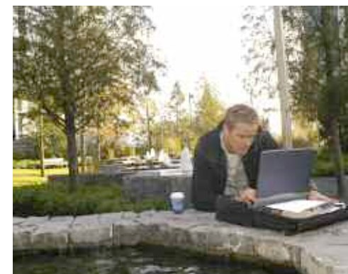
Jubilee Park, Canary Wharf, London