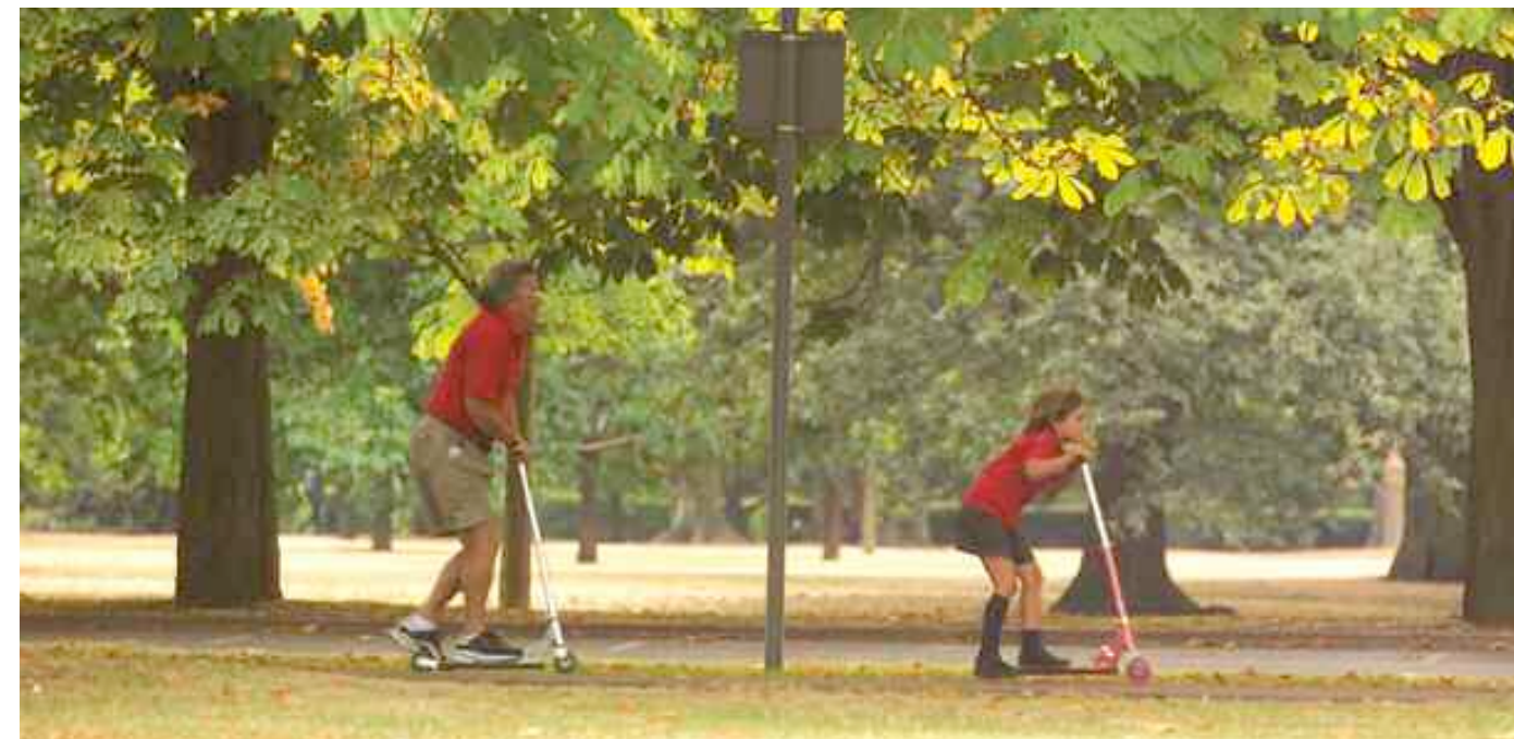
↳ Dinton Pastures, Berkshire ↳ One Tree Hill, London ↳ Windmill Hill, Bedminster, Bristol