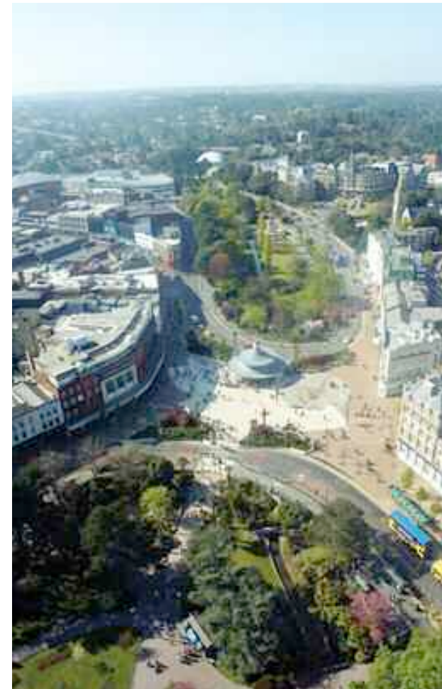
📍 The Methleys Home Zone, Leeds 📍 Bournemouth Square, Bournemouth

In Strasbourg, France, the city's public spaces and its transport system were improved in a joint strategy. Use of public transport has gone up by 43 per cent since 1990 thanks to the introduction of a 12.6km tramline and the doubling of the number of trams serving the city centre. At the same time, the city's streets and squares have been given a distinctive image, with important spaces along the tram's route, such as the main square, receiving special attention. Traffic levels in the centre have been reduced, and the tram's success in converting people from private to public transport (70,000 passengers daily) means that a total of 35km of new track is now planned. 45