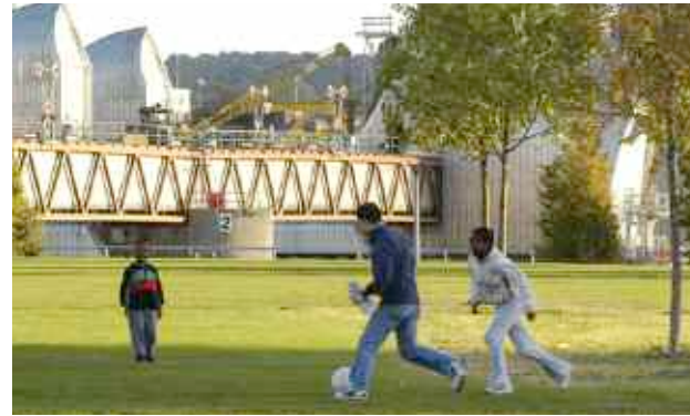
Thames Barrier Park, London

Evidence from Japan emphasises the vital role that tree-lined streets, parks and other green spaces play in our lives. Not only do they enhance our sense of community and our attachment to a particular neighbourhood – they can even help us live longer. Of more than 3100 people born between 1903-1918 in Tokyo, 2211 were still alive by 1992; the probability of their living for a further five years was linked to their ability to take a stroll in local parks and tree-lined streets. 20