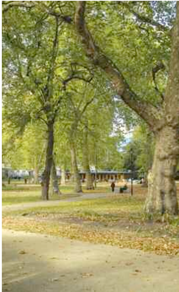
↑ Russell Square, London → Welsh Harp, West Hendon ↓ Manor House Gardens, Lewisham