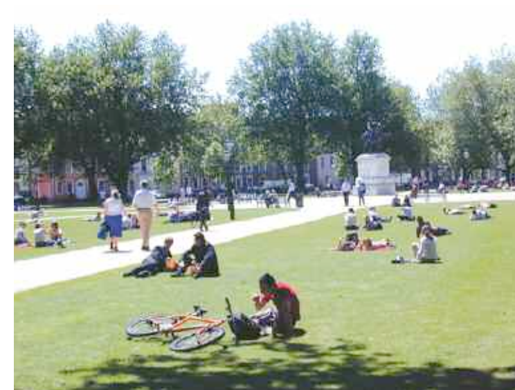
Queens Square, Bristol