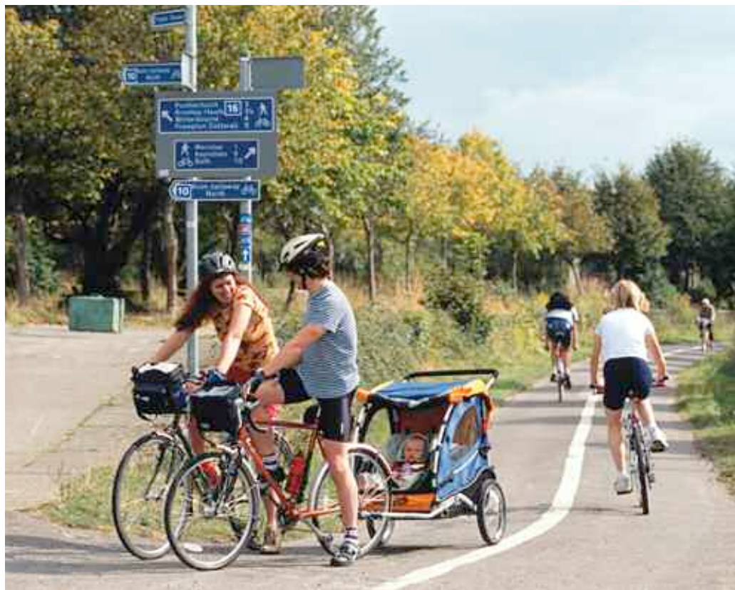
📍 Blue Carpet Square, Newcastle 📍 Cathedral Gardens, Manchester 📍 Bristol to Bath Cycle Path, Somerset

A study in Brisbane, Australia, compared street vitality and travel behaviour in gated and non-gated communities. It revealed that those living outside gated communities were affected by them, because they had to travel around them rather than through them, and their journey times were increased as a result. By measuring pedestrian behaviour and human interaction, the study also found that street vitality was higher in non-gated communities, where more than 30 per cent of activity was due to the presence of children. In contrast, children in the gated communities were restricted to playing in their own gardens. The study concluded that providing quality space is not enough – what is needed are high-quality public spaces. 47