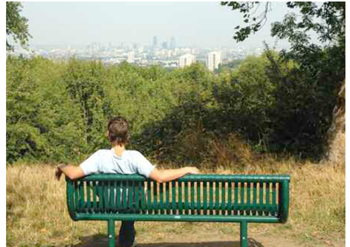
One Tree Hill, London