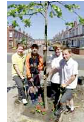
↳ Gorse Hill Estate, Stretford, Manchester ↳ Thames Path, Kingston-upon-Thames

The school playground provides an important daily opportunity for children to play and socialise. Taking a break from the traditional classroom setting is now recognised to be vital for a variety of reasons. Whatever their age, children learn better and more quickly when breaks are included in the academic timetable. For younger children in particular, non-structured outdoor breaks are effective in helping cognitive development. Time in the playground also gives children the chance to develop social skills by interacting with their peers and making friends. 30