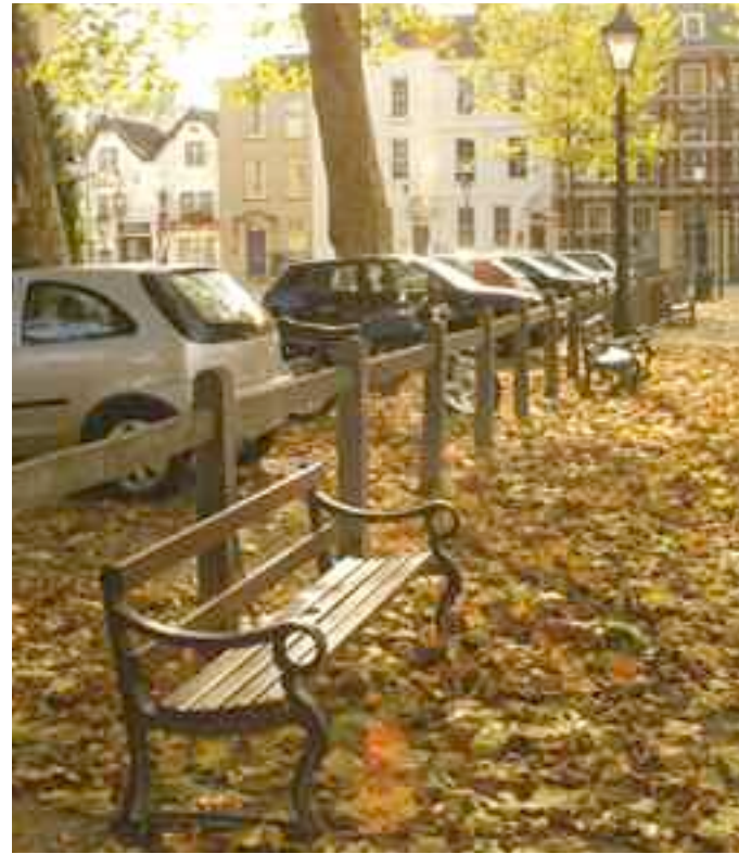
↑ Queens Square, Bristol ← St George's Park, Bristol

A similarly positive picture emerges from Dallas, where many residents cited the public green spaces running behind their back gardens as a major factor in their decision to move to the area. Sixty per cent of these residents believed that the value of their homes was at least 15 per cent higher because of the presence of the green spaces. Half of the people who did not have green spaces at the back of their homes said they would prefer to have this kind of communal green area close by, even though that would mean less private open space. Almost all residents valued these public green spaces highly and most used them for recreational activities regardless of whether or not their homes backed on to them. 8