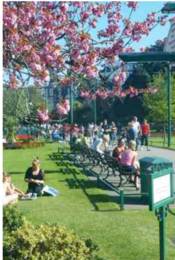
Mowbray Park, Sunderland